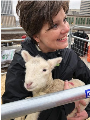
Ag Day 2018

Bonus coverage by Tennessee Capitol Report is now on Facebook, @TNCapitolReport.