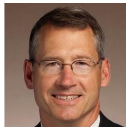
Sen. Bo Watson